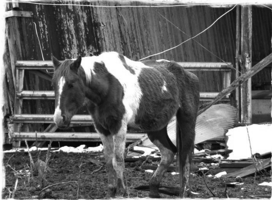
One of the horses at this farm, starving and living amidst mounds of trash and debris

Every bone was visible beneath her shaggy, mud-crusting coat. Her hips jutted out at sharp angles against the backdrop of the debris filled paddock where she was housed. I stood there staring at them, heart-broken at the thought of all that they had endured. Their thin bodies lacked the insulating fat needed to protect them from the sub-zero temperatures, fierce winds, and driving ice and snow that had pounded the area just a few weeks prior. I reminded myself that these were the lucky ones. Somehow they had mustered the strength and the will to survive, where so many of the others could not.