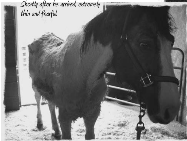
Shortly after he arrived, extremely thin and fearful.