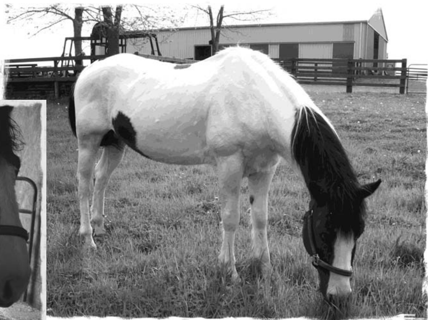
Enjoying some grazing time, starting to fill out, and his coat looking much better!

Yes, a horse was saved, but ultimately his redemption story points to a greater, eternal picture of salvation that involves a cross, a tomb and your response to the One who conquered them both so that you might be Redeemed.