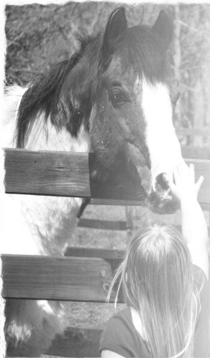
Remi is slowly learning to trust people.

As stepped out of the barn and into the open, he snorted and danced around me. I couldn't help but wonder how long it had been since he had been out of that stall or seen the sky above his head. I was delighted to have him out of that dark, oppressive barn. However to him, the bright daylight and wide open spaces must have been terrifying after so long in his familiar, cramped pen. It seemed almost too much for him as he spun to look at the horses first on one side of him and then the other.