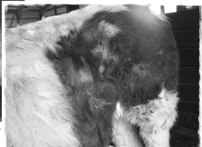
Remi's coat was horrid when he arrived, due to lack of nutrition and a severe lice infestation. Eventually he shed out and was left almost completely bald until his new coat came in.